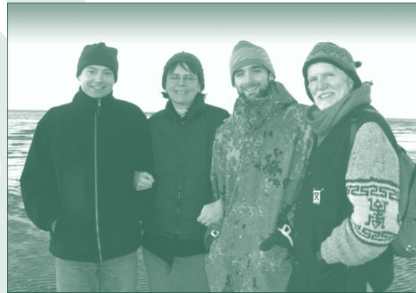
Some members of the core team.

“Never doubt that a small group of committed citizens can change the world.”